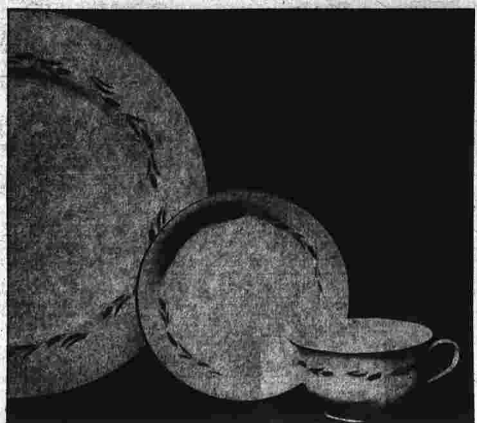
FINE IMPORTED CHINA, SERVICE FOR 8 (87 pieces) reg. 59.99 JUST 39.99

OPEN TONIGHT TILL 9:00! with pre-holiday savings!